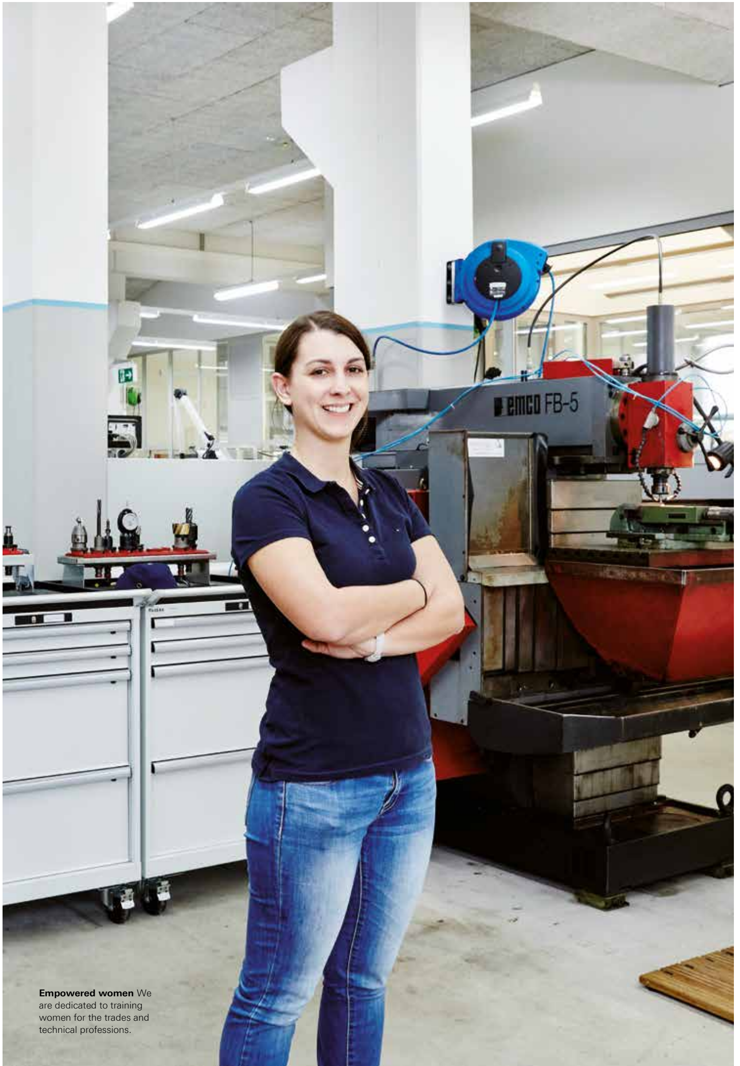
Empowered women We are dedicated to training women for the trades and technical professions.