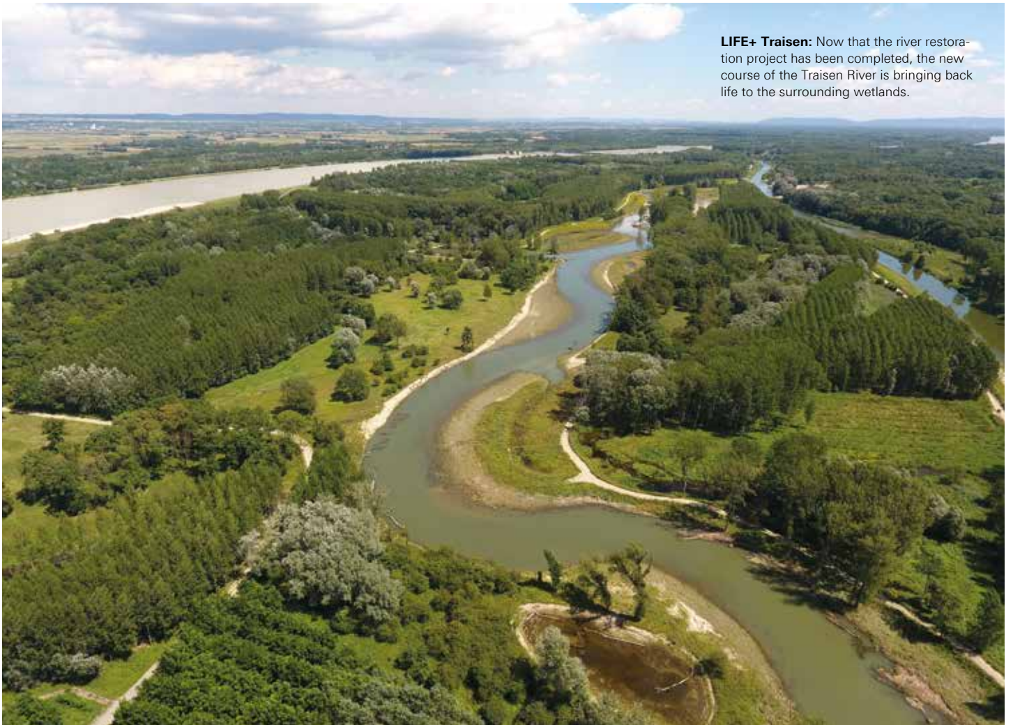
LIFE+ Traisen: Now that the river restoration project has been completed, the new course of the Traisen River is bringing back life to the surrounding wetlands.