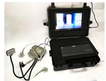
Buckling Visualisation System

Expert system for fast and safe offline inspections of the slot exit area