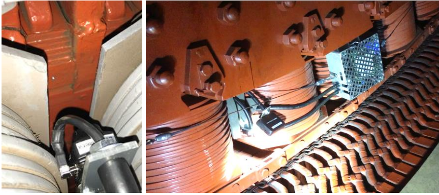
Positioning of the inspection device at the rotor and camera alignment