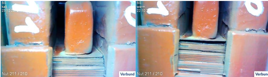
Precise slot allocation and comparison heat-/cold-inspection